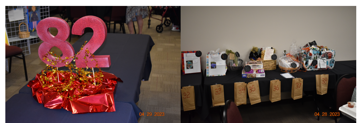
2023 marks the 82<sup>nd</sup> anniversary DKG Oregon State Organization

OSO State Convention " Empowering Independence " was held at the Independence Hotel in Independence, OR. Valuable and enlightening information was shared during the convention through workshops and keynote speakers. Elections were held and awards were given to chapters and members. The following pictures should tell the story.